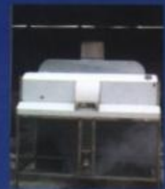
啓動除煙賣後的油煙排放情況 Oil mist emission – CrystalVent is turned on