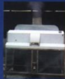
未啓動除煙賣前的油煙排放情況 Oil mist emission – CrystalVent is turned off

New advanced “CrystalVent” Electrostatic Precipitator with Continuous Water Spray is the best solution for restaurants to solve the oil mist problem and comply with environmental standards. Apart from our standard CrystalVent model, we can also offer tailor design to suit the requirements of different applications.