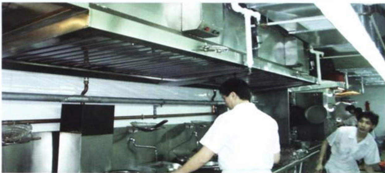
除煙寶應用於中式酒樓食肆的實例 Application of CrystalVent in a Chinese restaurant

粒積累在收集板後，便很快引起電場放電，喪失除油煙效果；因此，舊式靜電除油煙機必須頻頻清洗，否則效用便會迅速下降。此外，舊式靜電除油煙機採用管道式設計，一般安裝於廚房天花或食肆外的空間；若安裝於廚房天花，維修清洗十分困難，而安裝於食肆外又大多因為佔用食肆外的空間而需要大業主的允許，手續繁複。